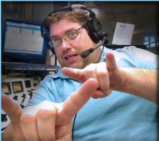
STEW AT WJOB