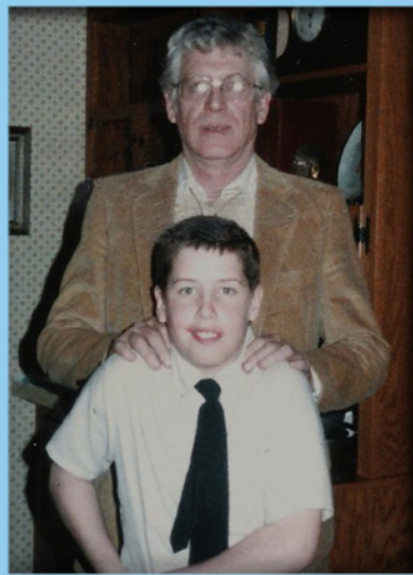
STEW & DAD